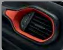
Black Cloth with Ruby Red Bezel Accents and Stitching