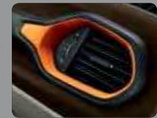
Bark Brown / Ski Grey Leather with Anodized Orange Bezel Accents and Stitching