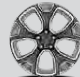
18" aluminium wheels (optional)