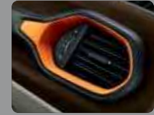
Bark Brown / Ski Grey Cloth with Anodized Orange Bezel Accents and Stitching