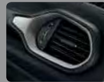
Black Leather with Satin Silver Bezel Accents and Stitching