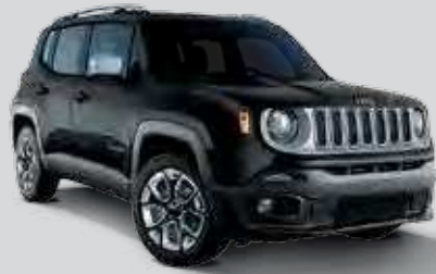
Carbon Black Metallic