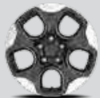
16" aluminium wheels (standard)