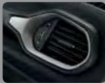
Black Premium Cloth with Satin Silver Bezel accents