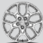
17" aluminium wheels (optional)