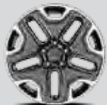
17" aluminium wheels (standard)

*Jeep® Renegade Trailhawk available late 2015