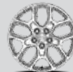
17" aluminium wheels (standard)