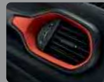
Black Leather with Ruby Red Bezel Accents and Stitching