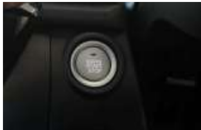
SMART KEYLESS ENTRY AND A PUSH START BUTTON.