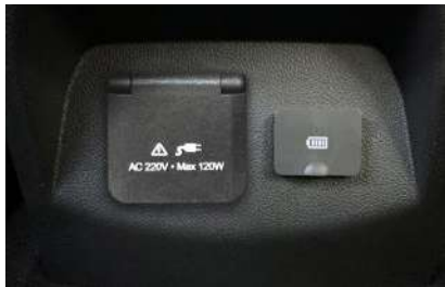
220V POWER OUTLET.

The ACC automatically adjusts the vehicle speed to maintain a safe following distance.