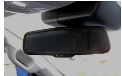
AUTO-DIMMING MIRROR & DASHCAM POWER OUTLET.